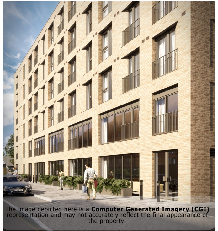
The image depicted here is a Computer Generated Imagery (CGI) representation and may not accurately reflect the final appearance of the property.

Anti Money Laundering (AML) regulation it is now standard procedure to undertake a personal and company and general AML checks.